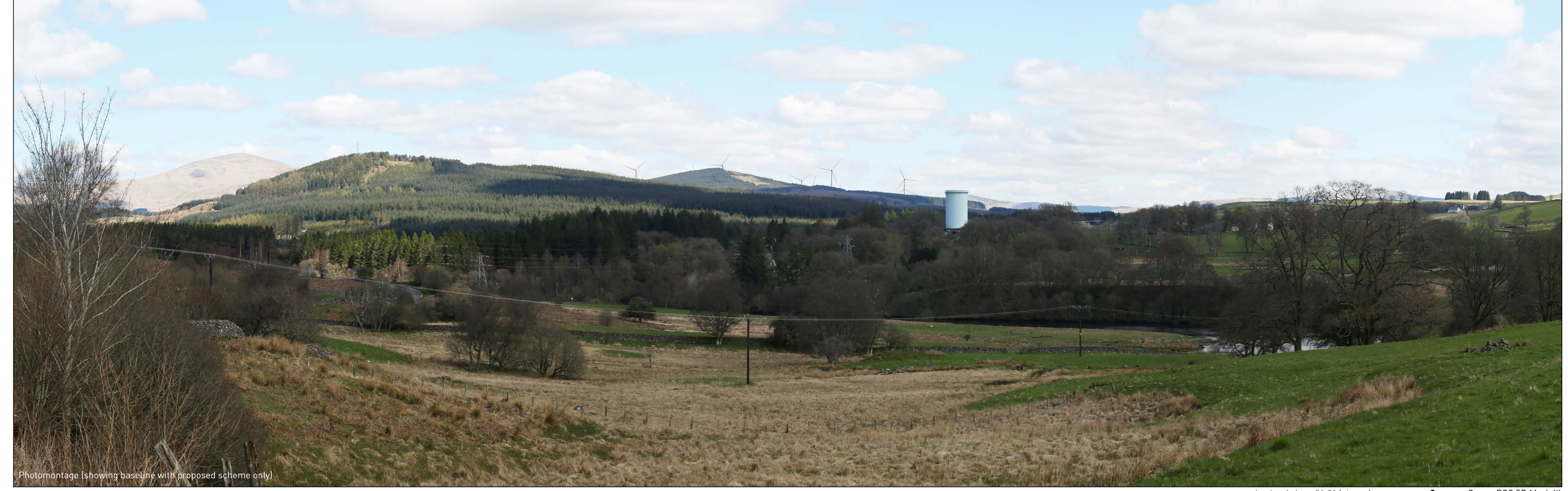
Figure 8.54 (sheet C) Viewpoint 18: A713 north of Stroansgassel SHEPHERDS' RIG WIND FARM